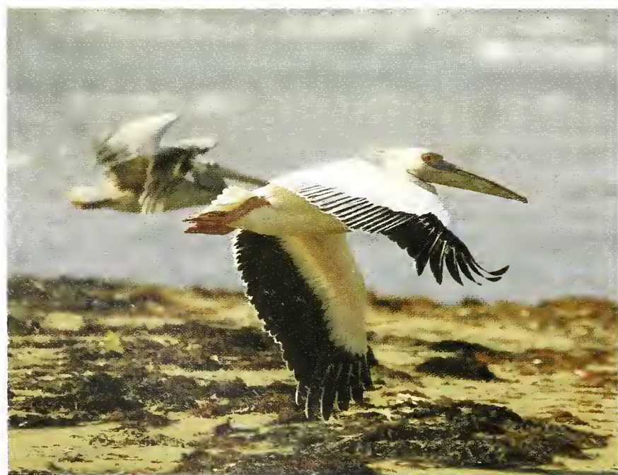
Figure 1. Adult Great White Pelican Pelecanus onocrotalus , Desset River estuary, 10 km north of Massawa, 5 January 2009 (Giuseppe De Marchi)

Second record for Eritrea. GDM photographed (Fig. 1) an adult P. onocrotalus within a flock of Pink-backed Pelicans P. rufescens at the Desset River estuary, 10 km north of Massawa, on 5 January 2009 (De Marchi et al. 2009). J.